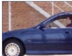
Progressive Scan, all lines are captured at the same time

Progressive scan is used instead of the interlaced method found in analog CCTV (PAL/NTSC) cameras. With progressive scan all pixels (lines) are captured at the same time, enabling moving images to be presented without distortion.