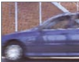
Interlaced, 20 ms difference between odd and even lines