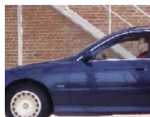
Progressive Scan, all lines are captured at the same time

Progressive scan is used instead of the interlaced method found in analog CCTV (PAL/NTSC) cameras. With progressive scan all pixels (lines) are captured at the same time, enabling moving images to be presented without distortion.