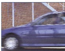
Interlaced, 20 ms difference between odd and even lines