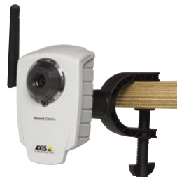
AXIS 207/207W Network Camera with flexible clamp - clamp included