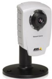
AXIS 207/207W Network Camera with camera stand - stand included